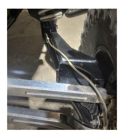
<u>STEP 5:</u> Reinstall wheels. FINISHED