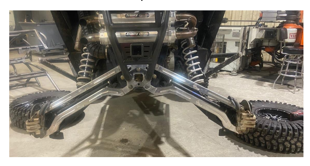
STEP 2: REMOVE OLD TRAILING ARMS

You will need to drill out the rivets holding the brake line clamps on the trailing arm. Also remove the factory plastic brake line cover from the trailing arm at the rear. Using a 15mm socket and wrench, remove the 4 bolts holding the bearing carrier to the trailing arm. You will need to place transmission in neutral in order to spin the hub for reaching each bolt. After the bearing carrier bolts, use an 18mm socket and wrench to remove the bolts at the frame end, sway bar link, and finally, the shock bolt.